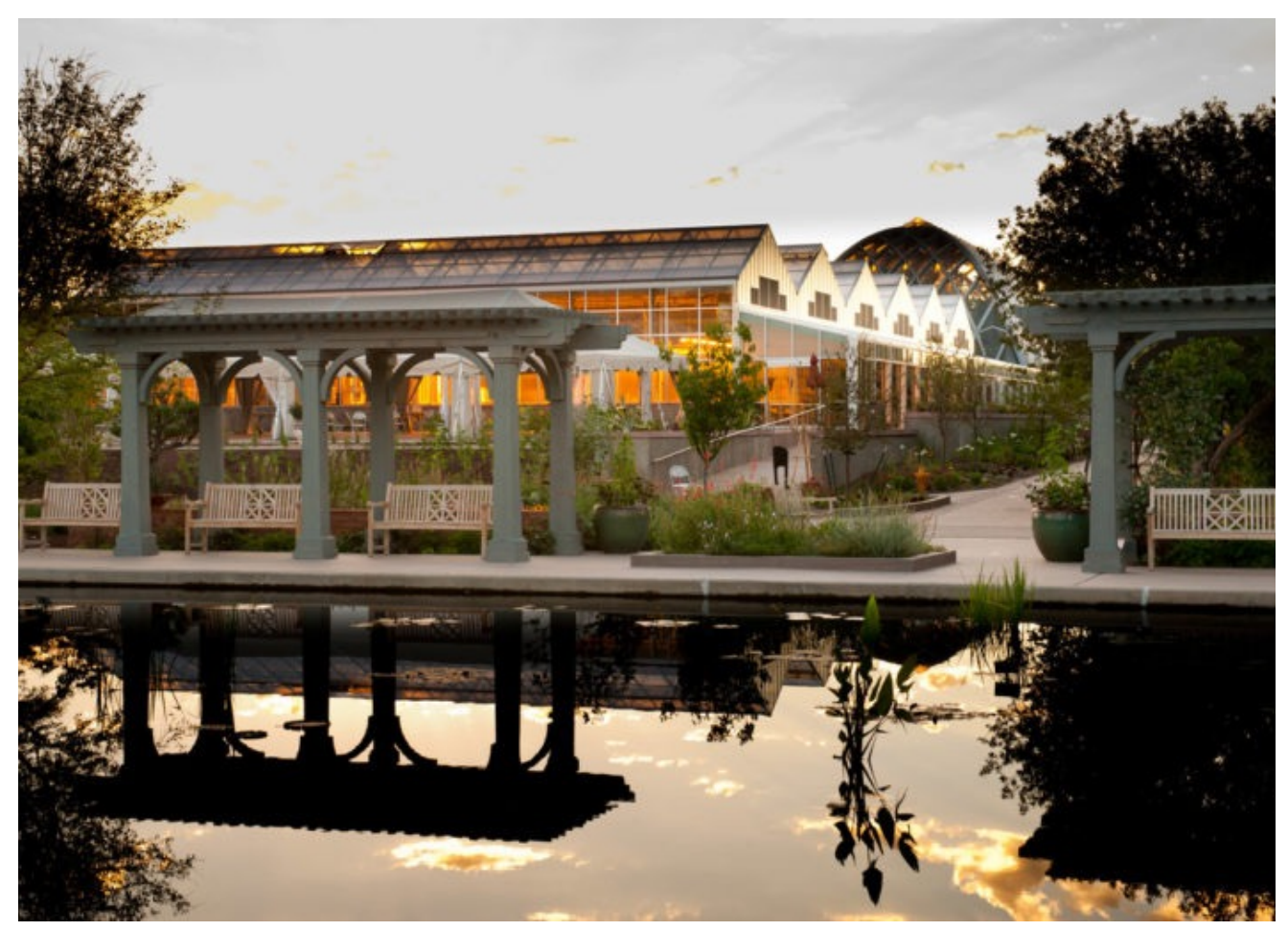
Denver Botanic Gardens

The SRMA Fall Meeting will be held on October 7, 2016 at the Denver Botanic Gardens, 1007 York St. Denver, CO 80206, with the theme of "Archival Narratives".